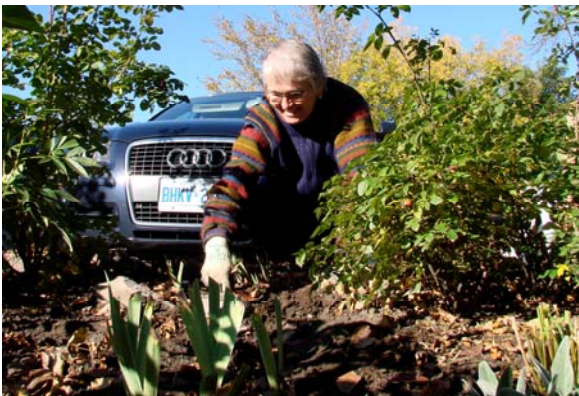
"I came that they may have life, and have it abundantly." John 10:10

This fall, each household is being asked to consider giving from its God-given abundance and move up to the next $500 range.