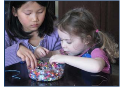
Working with beads