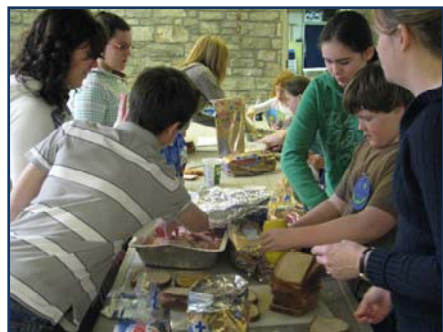
Reaching out to their community: Children and youth making sandwiches